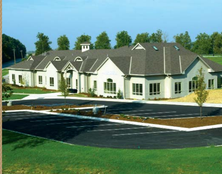
Tom Spurgeon Indoor Training Center

The Golfchannel.com polled over 160 college golf coaches to determine the top 10 college courses in the U.S., and the Kampen Course came in at #4.